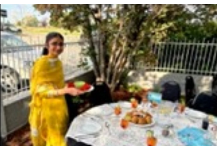
First, complimentary welcome drinks, (I) this was followed with Samosas & Chicken Pakora Appies (r)